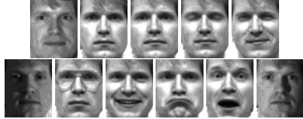
Figure 2: Samples from the Yale database. First row: Samples from training set. Second row: Samples from test set.

We compare the proposed local appearance-based approach with several well-known holistic face recognition approaches – Principal Component Analysis (PCA) [15], Linear Discriminant Analysis (LDA) [2], Independent Component Analysis (ICA) [1], global DCT [4] – as well as another DCT based local approach, which uses Gaussian mixture models for modeling the distributions of feature vectors [12]. This approach will be named “local DCT + GMM” in the remainder of the paper. Moreover, we also test a local appearance-based approach using PCA for the representation instead of DCT which will be named Local PCA in the paper. In all our experiments, except for the DCT+GMM approach, where the classification is done with Maximum-Likelihood, we use the nearest neighbor classifier with the normalized correlation d as the distance metric: