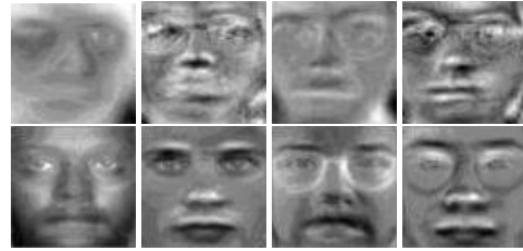
Figure 1: Eigenface bases computed from mis-aligned (top) and well-aligned (bottom) images.

The main goal of this work is to show that local appearance based face recognition is more robust against variations on facial appearance than the traditional holistic approaches (PCA, LDA, ICA). In this paper we utilize local information by using block-based discrete-cosine transform (DCT). The main idea is to mitigate the effects of expression, illumination and occlusion variations by performing local analysis and by fusing the outputs of extracted local features at the feature and at the decision level. The reason for preferring DCT over Karhunen-Loeve transform (KLT), which is known to be the optimal transform in terms of compactness of representation, is mainly because of its data independent bases. To construct the appropriate bases by KLT for data representation, one has to align training face images properly, otherwise the basis images can have noisy appearance.