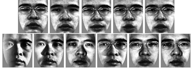
Figure 4: Samples from the CMU PIE database. First row: Samples from training set. Second row: Samples from test set.

The face database derived from the CMU PIE face database [14] consists of 2720 face images of 68 individuals. Each individual has 40 face images. 20 images are chosen for training that correspond to normal appearance and expression variations (from the expression and talking set), and the rest, which are taken under different illumination conditions, are used for testing. The face images are aligned and scaled to a resolution of 64x64 pixels.